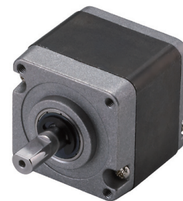
外形尺寸 & 馬達齒銜尺寸 / Appearance Size & Pinion Assembly Dimension