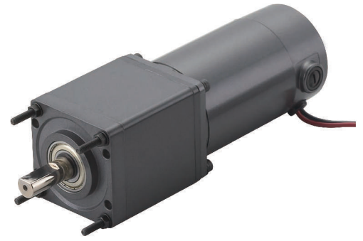
外形尺寸/ Appearance Size