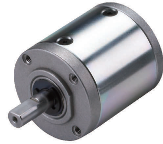
外形尺寸 & 馬達齒鉤合尺寸 / Appearance Size & Pinion Assembly Dimension