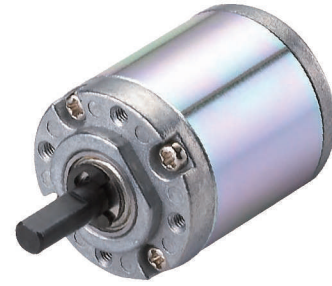
外形尺寸 & 馬達齒鉤合尺寸 / Appearance Size & Pinion Assembly Dimension