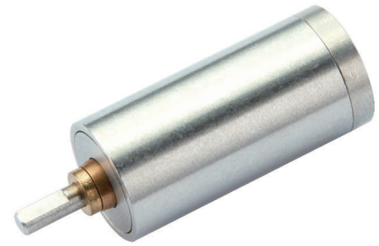
外形尺寸 & 馬達齒鉤合尺寸 / Appearance Size & Pinion Assembly Dimension